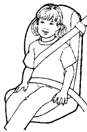
BOOSTER SEAT with High Back Belt-Positioning

Usually kids over 80 pounds can fit in Lap/Shoulder Belts .