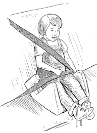
BOOSTER SEAT Belt-Positioning

Children between 40 and about 60/80 pounds (usually 4 to 8 years old) should be in Booster Seats .