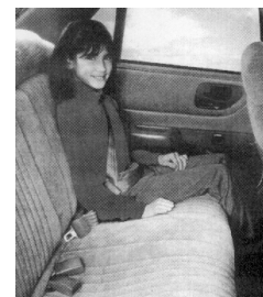
LAP/SHOULDER BELTS Belt-Positioning

Usually kids over 80 pounds can fit in Lap/Shoulder Belts .